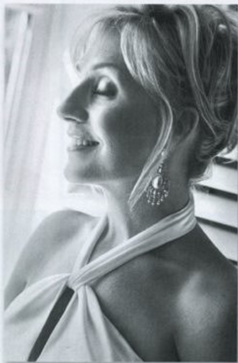
See also cover photo of this magazine.